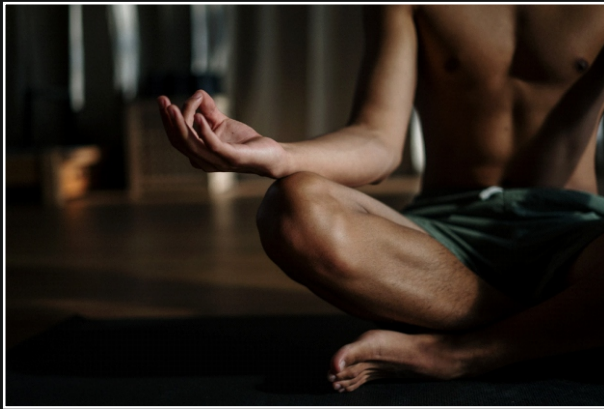
Health balance. Monitor physical & emotional resource balance to improve performance.