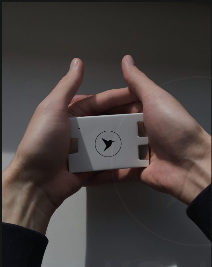
“Device being held during screening process”

5 minutes ECG signal is analysed via AI neural network to determine medical & lifestyle parameters.