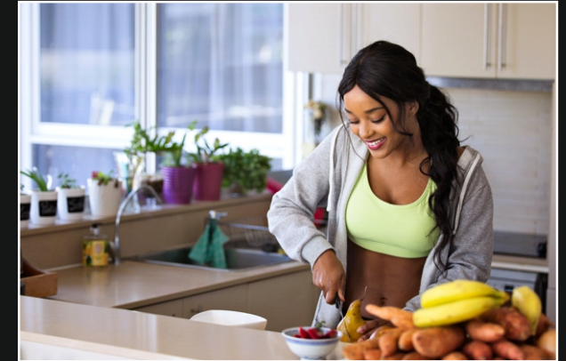
Diet Reduce body stress by activating parasympathetic activity through diet.