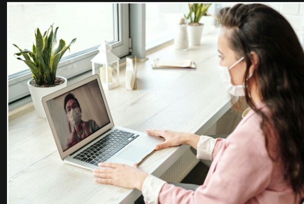
CVD. Allows medical professional to look after your health remotely, without regular doctor visits.