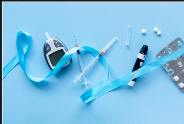
Diabetes type 2. Determine cardiac risks at their early stages and keep DB2 problem under control.