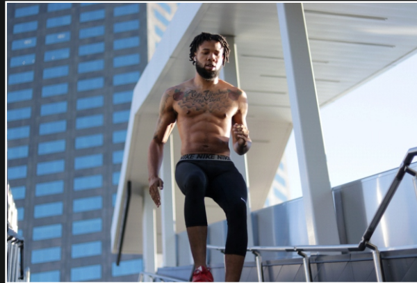
Sport. Monitor physical activity results and track body recovery after intensive training sessions.